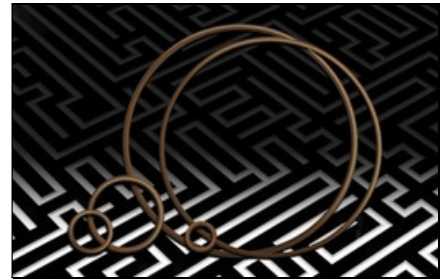
Kalrez® 9300 parts are based on a proprietary crosslinking and mechanical reinforcement system which is only available from DuPont.

Kalrez® 9300 exhibits excellent resistance to oxygen and fluorine-based plasma and etch process chemistry. It also offers very low metals content, excellent thermal stability and mechanical strength, and is well suited for both static and dynamic sealing applications. A maximum application temperature of 300°C (572°F) is suggested. Ultrapure post-cleaning and packaging is standard for all Kalrez® 9300 parts.